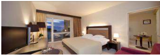
HOTEL SOL GARDEN ISTRA 4*: